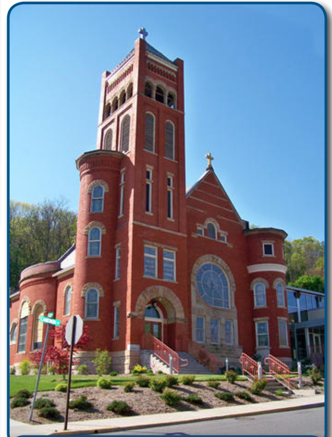
St. Matthew Church; Tyrone • $500 Restoration of church bells