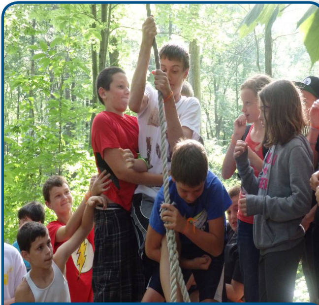
Diocesan Family Life Office • $500 Scholarships for Camps “Z” and Timothy