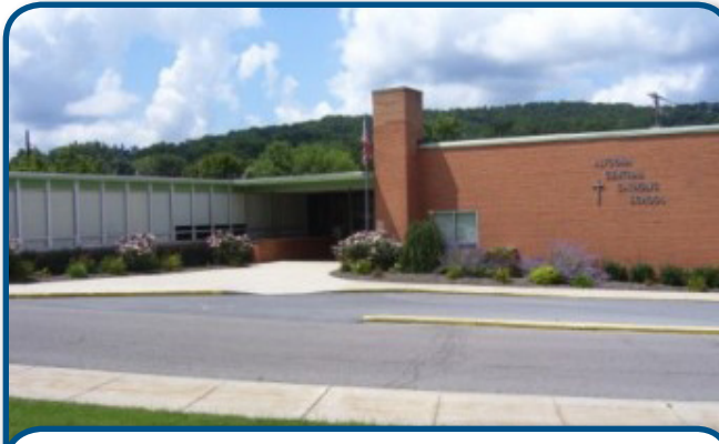
Altoona Central Catholic School • $500 Door entry system at our elementary school