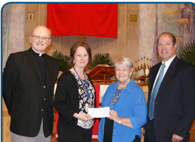
St. Peter School • $2,500 Expansion of classroom libraries