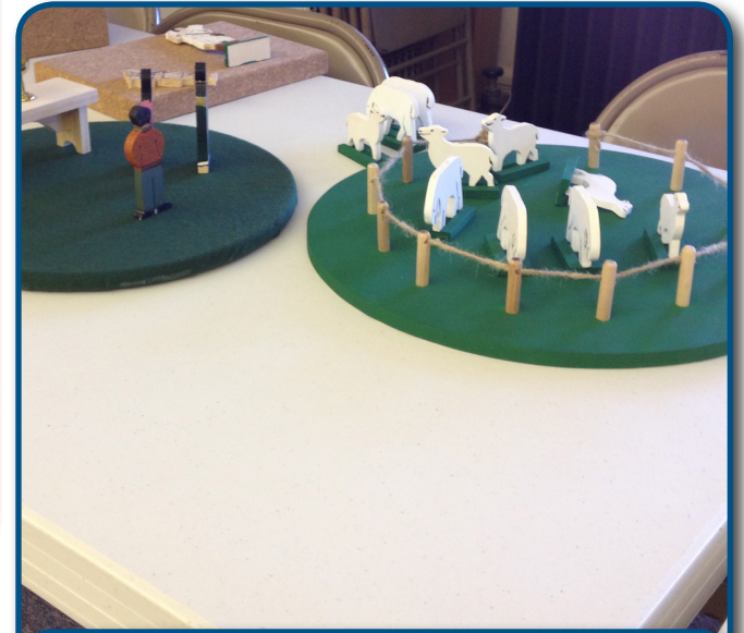
Holy Spirit Parish; Lock Haven • $2,500 Catechetical program, training staff, and purchasing materials